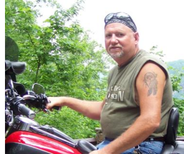
By Eddie Mann

It's fall riding time! Just getting ready to pack for the ride to Tellico Plains for the chapter fall ride. There are certain things to be cautious about when riding in the fall. Wet leaves falling on the road is a big issue. Nothing like rounding the curve and there are some fresh fallen wet leaves there to meet you. Another increased hazard are the Deer and Turkey traveling around. They think they own the road and your just cruising though their passage way. Hope everyone got to make some of the many rides the chapter has put together this year. I wish I would have been able to make more, but there's never any disappointment for what the road captains put together for the members. A lot of work goes into thinking about a place to ride that everyone would enjoy, not mentioning making the route and ride fun for all. So if you enjoyed the ride you were on thank the road captain. If there was something about the ride you didn't like that's ok too, we would like to know so we can improve the next time out. The chapter is always looking for new Ideas and people willing to plan and lead a ride, so if you're interested in being a Road Captain let a chapter officer know and they can go over the details of being a Road Captain. As Always Ride and Have Fun