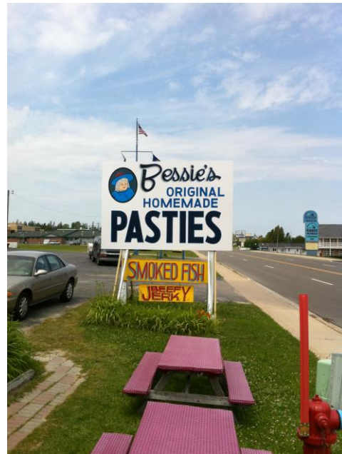
Pasty Shop St. Ignace, MI