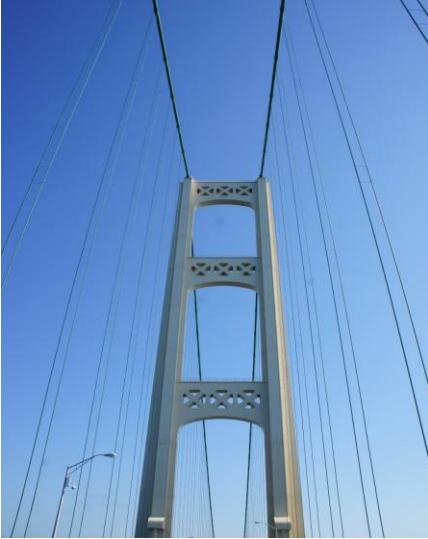
Mackinaw Bridge Mackinaw City, MI