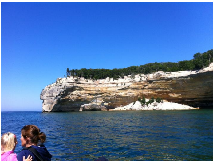
Picture Rocks Munising, MI