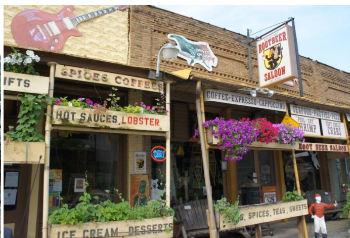
Root Beer Saloon

R Hwy 99 out of dealership ( 5m ) L Hwy 431 ( 9m ) L Thompson Station Rd (5m Thompson Station, 4m 9m ) R Carters Creek Pk/Hwy 246 ( 6m ) L Southall Rd ( 4m Leipers Fork) L Hwy 46 (32m Dickson , 31m Cumberland City - FERRY , 10m Indian Mounds, 4m 77m ) L Hwy 79 ( 7m ) R Joiner Hollow Rd ( 2m ) L Hwy 120 (4m Bumpus Mills, 3m KY Border 7m ) Continue Hwy 139 (17m Cadiz , 7m 24m ) L Hwy 93 (4m Lamasco, 4m Confederate, 5m I-24, 5m 18m ) R Hwy 641 (1m Eddyville , 10m Fredonia, 5m Crayne, 5m Marion 21m ) L Belleville St/Hwy 91 ( 11m FERRY ) Continue Hwy 1 (1m Cave-In-Rock, 12m 13m ) L 5600E/Cty Rd 13/Pounds Hollow Rd/Karbers Ridge Rd ( 9m ) R Cty Rd 10 ( 1m ) L Garden of Gods Rd ( .5m Garden of the Gods ) Backtrack Cty Rd 10 SOUTH ( 1m ) R Karbers Ridge Rd ( 3m ) R Hwy 34 (2m Herod, 8m 10m ) L Hwy 145 (11m Eddyville, 6m Glendale 17m )